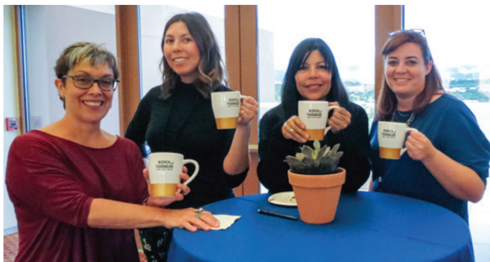
Women of Thornburg kickoff event

The Women of Thornburg is an employee resource group at Thornburg for those who identify as women or gender nonconforming. The group organizes networking events, educational opportunities, and ways to give back to the community. Like Girls Inc. of Santa Fe, Women of Thornburg believe in the important work to engage, elevate, and empower women in their careers and communities.