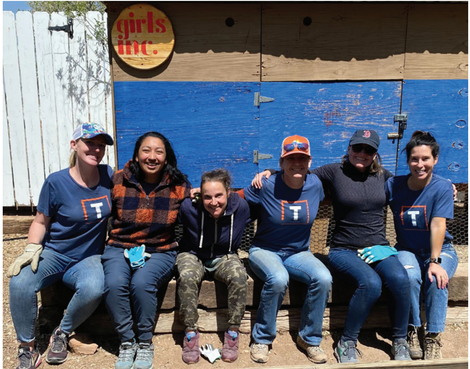
Women of Thornburg volunteer at the Girls Inc. of Santa Fe Campus Spring cleanup event

WOMEN of THORNBURG ENGAGE • ELEVATE • EMPOWER