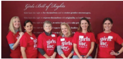
Career day at Girls Inc. of Santa Fe

WOMEN of THORNBURG ENGAGE • ELEVATE • EMPOWER